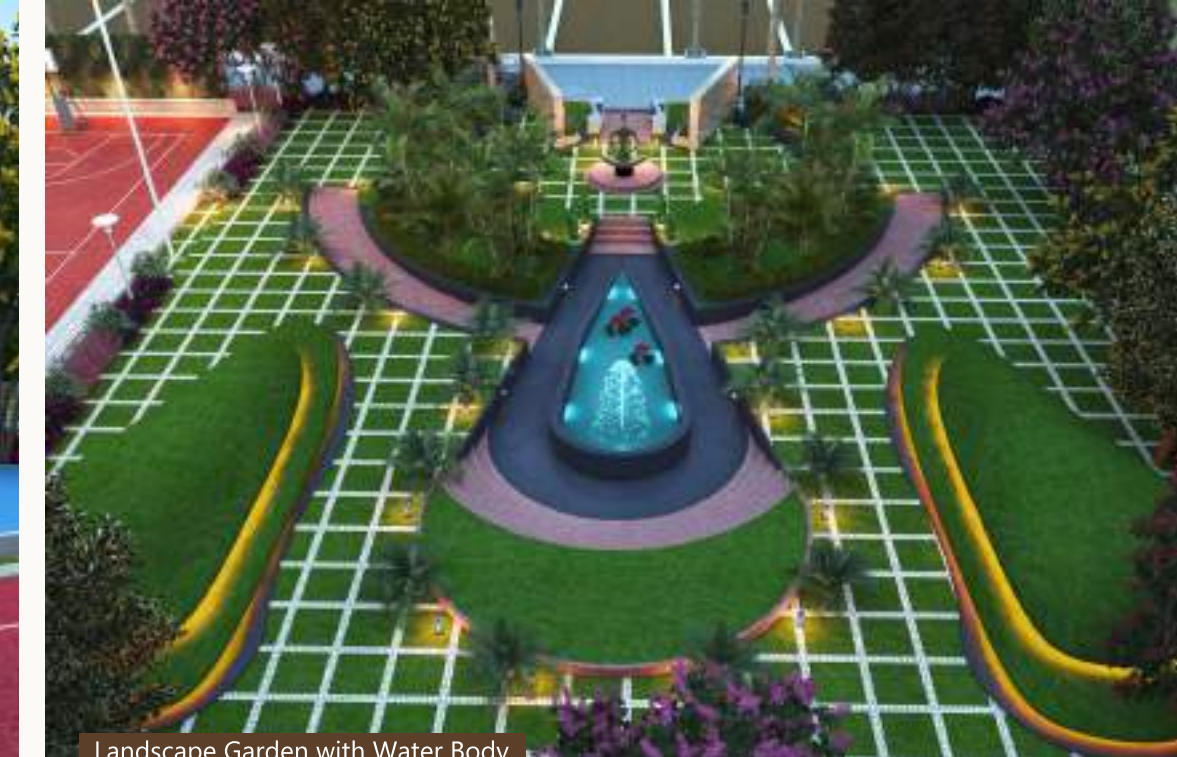
Landscape Garden with Water Body