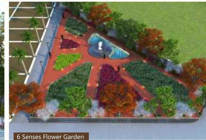
6 Senses Flower Garden