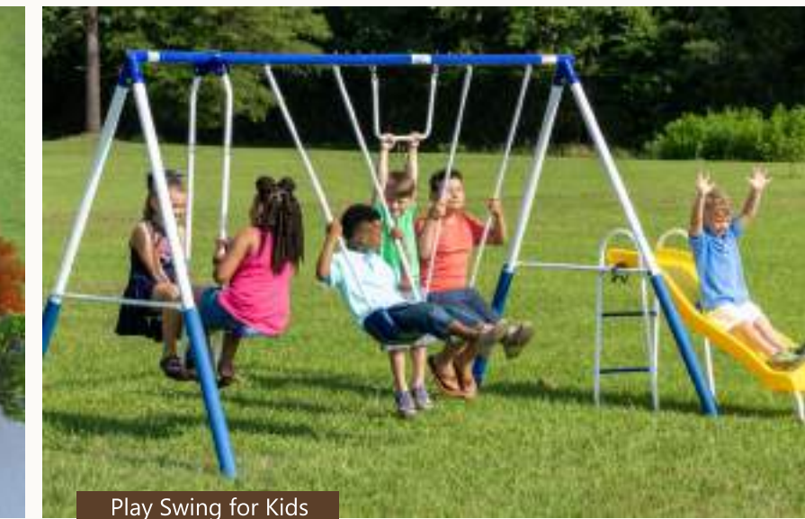
Play Swing for Kids