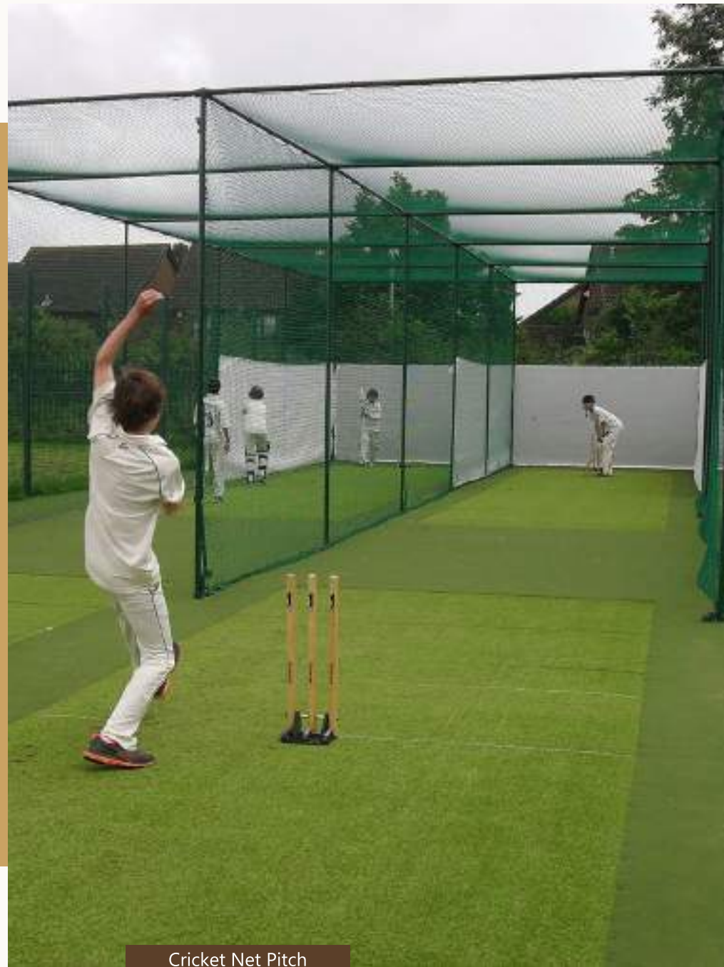
Cricket Net Pitch